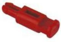
CR CDS coding pin